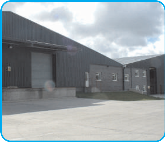
New Dry Food Warehouse at Pencader

Cambrian Pet Foods manufacturing platform includes two state-of-the-art manufacturing facilities located in Pencader and Llangadog, Carmarthenshire, Wales, UK. These plants utilize high-speed equipment and leading-edge technologies to produce pet food in 400g and 1200g can sizes at rates of up to 450 cans per minute, and complete dry foods at a rate of up to 6,500kg per hour, packed in varying formats from 500g to 15kg packs. These facilities are designed for maximum flexibility, which, in turn, allows Cambrian to provide the full range of products customers' demand.