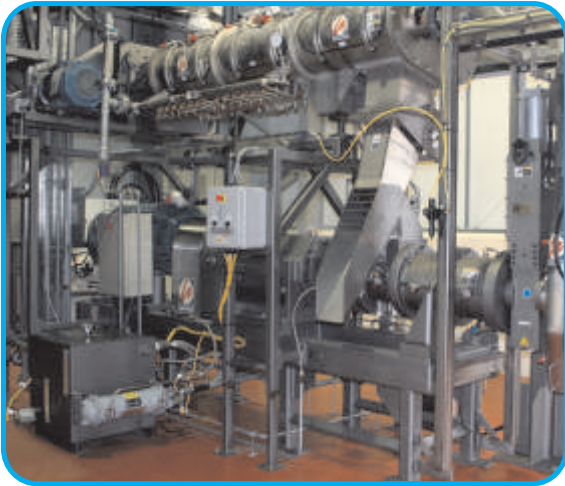
Wenger Twin Screw Extruder