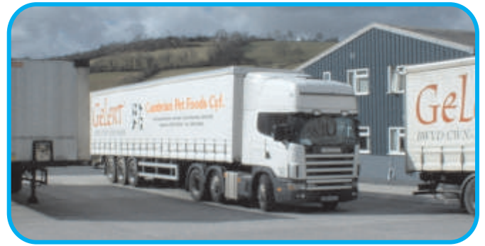
Cambrian Pet Foods Distribution