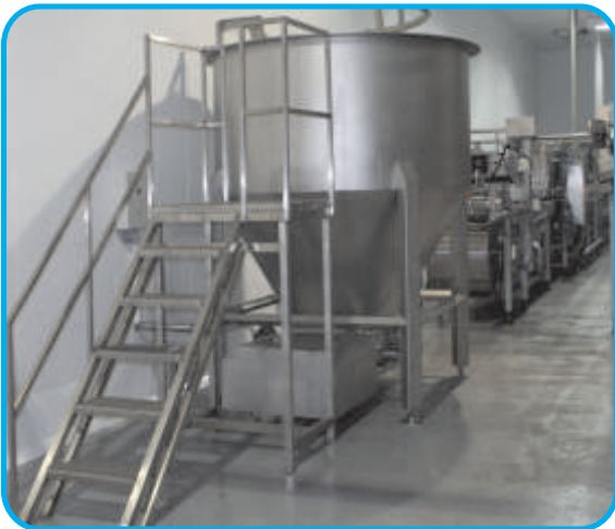
Chunk Steam Tunnel